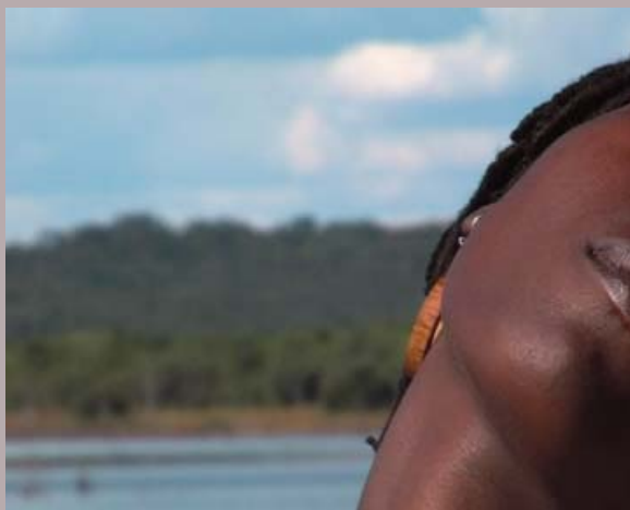
Tanyaradwa (2009). Mejor documental gallego / Best Galizan documentary (Play-Doc)