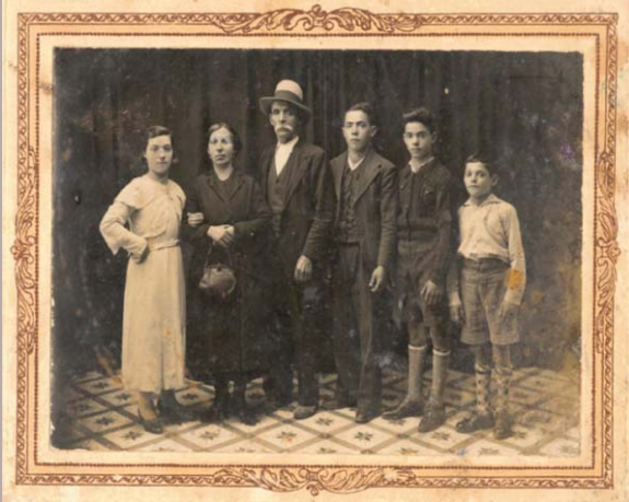
Bs. As. (2006). Mejor ensayo / Best film-essay (Premio Cine-Ensayo Román Gubern). Mejor documental gallego / Best Galizan documentary (Play-Doc)